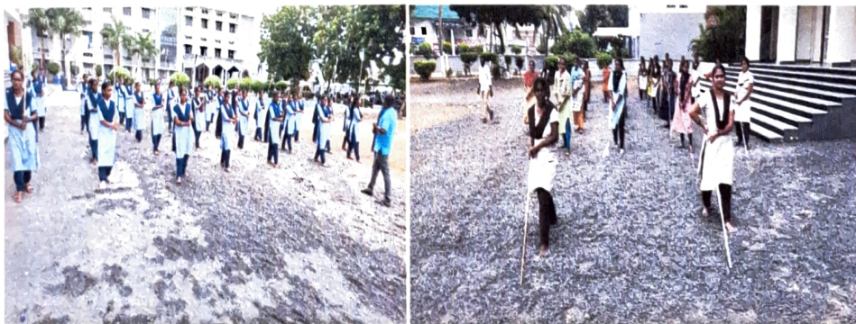
Karrasamu practicing by students